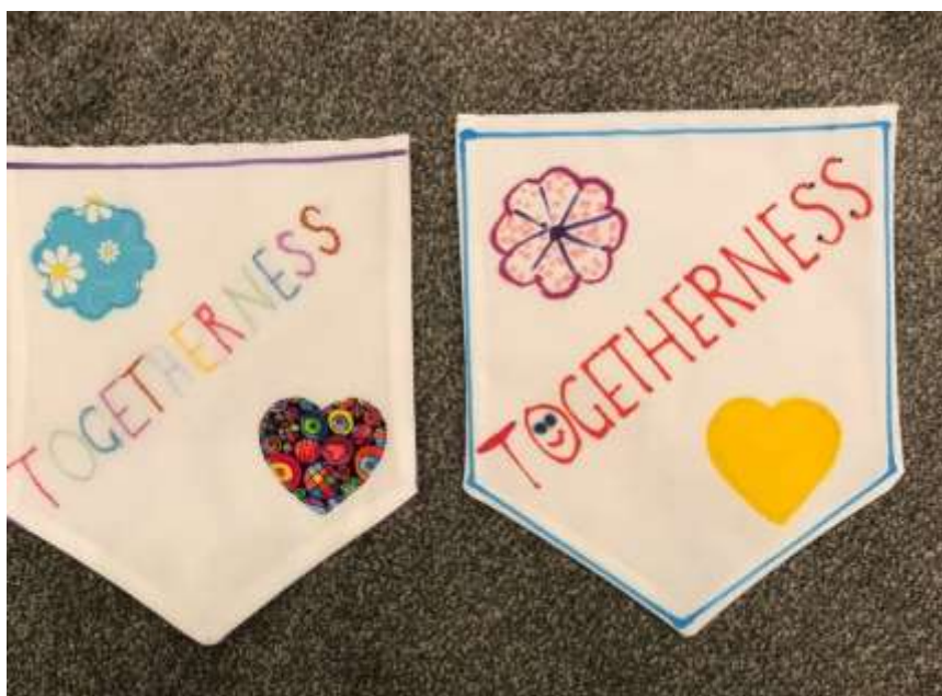
Example 3: Bring your squares back to us when our shops open back up and our volunteers will make your design into bunting,