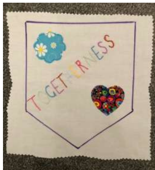
Example 2: Hand or machine sew